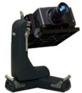
▲ YK100 with Christie HD10K-M