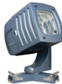
▲ Christie XE100-7kW