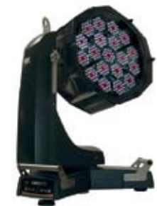
▲ Christie LED100-32K