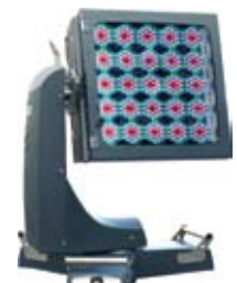
▲ Christie LED100-40K