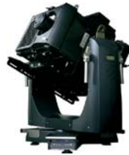
▲ YK200 with Christie Roadster S+20K

These new integrated digital luminaire systems – backed by Christie's industry-leading warranties, service and support – deliver high brightness, performance and reliability to dazzle your audience... anywhere... every time!