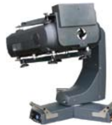
▲ YK100 with Christie LX1500